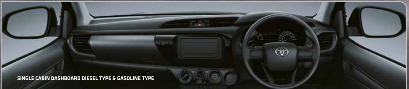
SINGLE CABIN DASHBOARD DIESEL TYPE & GASOLINE TYPE